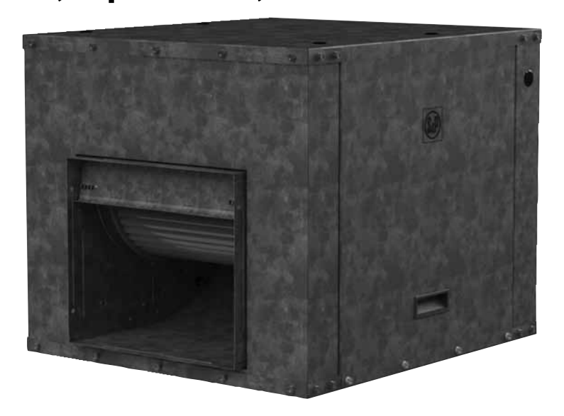
Forward Curved Inline Duct Blowers